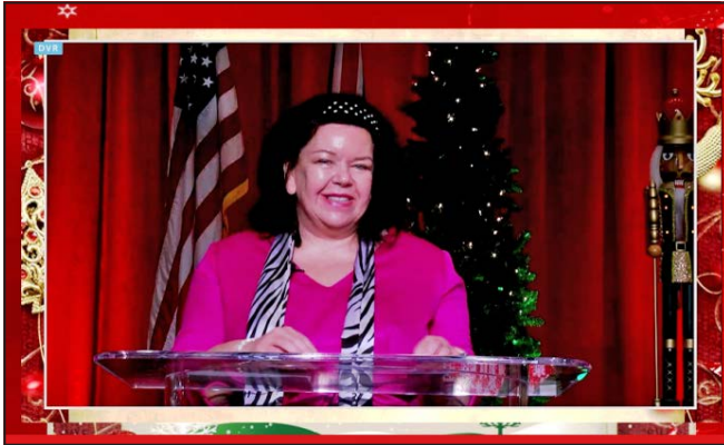
Ambassador Karen Pierce

With the support of all of our generous sponsors and guests, BABA donated a portion of the proceeds to SOME (So Others Might Eat) an interfaith, community-based organization that exists to help the poor and homeless of our nation's capital. They strive to meet the immediate daily needs of the people they serve with food, clothing, and healthcare. In addition they offer additional services such as affordable housing, job training, addiction treatment, and counseling, to the poor, the elderly, and individuals with mental illness. Each day, SOME is restoring hope and dignity one person at a time.