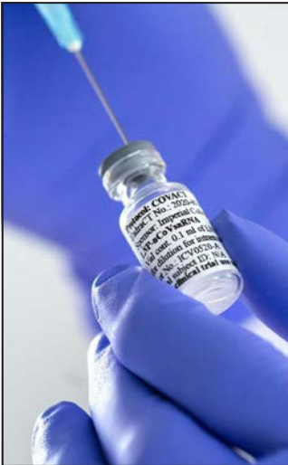
On Page 9 COVID-19 Vaccine Partnership