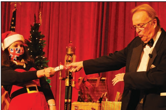
It's Christmas Cracker opening time!