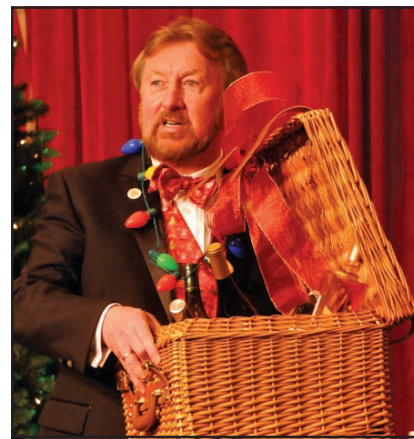
Who will win the wine basket?