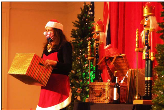
Mrs. Claus gets ready for the raffle