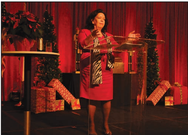
Her Majesty's Ambassador, Dame Karen Pierce, DCMG

The Christmas Party show, live-streamed from the Fairmont, can be viewed here.