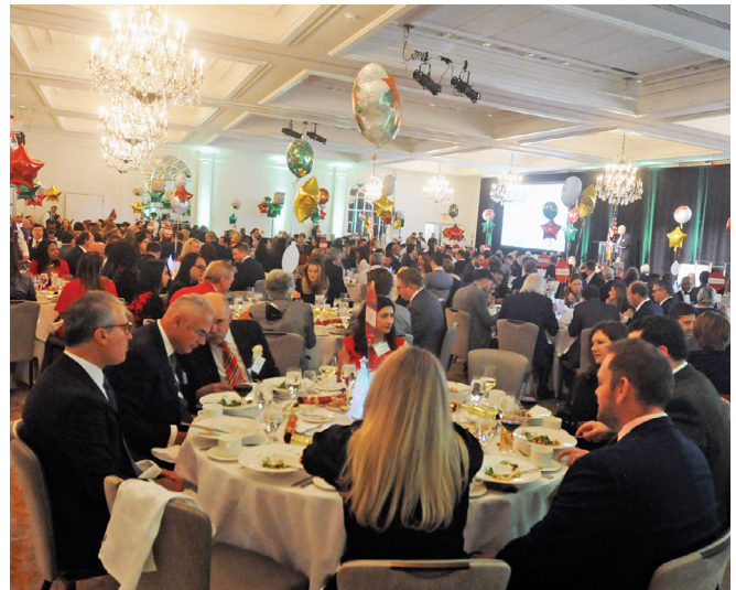
A sell-out crowd at the 27 th Gala Christmas Luncheon.