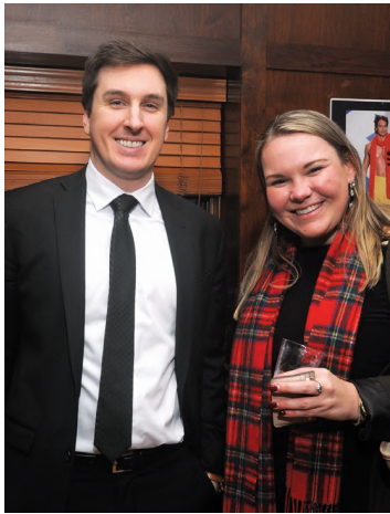
On Page 7 Scottish Christmas Drinks