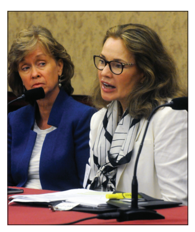
On page 5