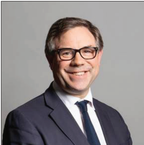
Jeremy Quin MP, UK's Minister of State for Defence Procurement

The roundtable discussion covered how new climate ambitions by businesses and governments at COP26 are now driving commercial policy and impacting the global trade agenda and thoughts on developing policies such as carbon border adjustment mechanisms.