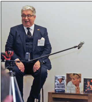
Page 6 – Bestselling author discusses the Royals and Brand Messaging