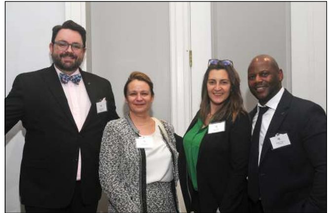
Guests from the Fairmont pause for a photo