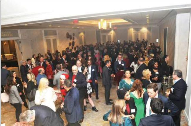
Guests enjoy the pre-luncheon cocktail reception