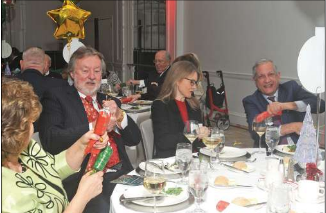
The Christmas cracker opening