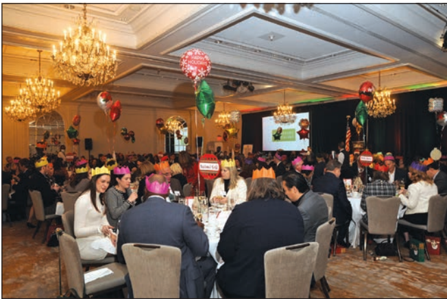
Plenty of networking during the Christmas Luncheon.