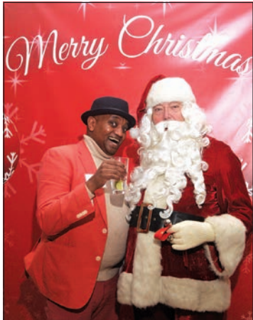
More Christmas Photos on Pages 6-7