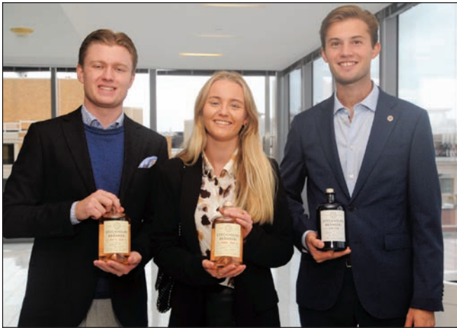
Colleagues from the SACC-DC display Sweden's Stockholm's Bränneri Dry Gin