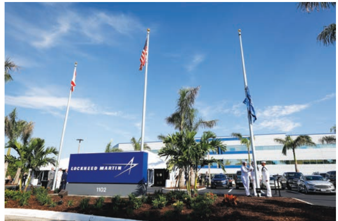
Flags were hoisted for the first time in July at the new headquarters for Lockheed Martin's Fleet Ballistic Missile program in Titusville, Florida.

Headquartered in Bethesda, Maryland, Lockheed Martin is a global security and aerospace company that employs approximately 105,000 people worldwide. For details, visit http://www.lockheedmartin.com/FBM .