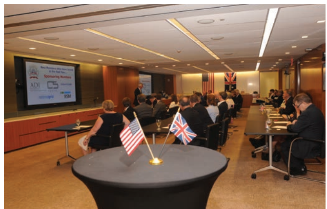
BABA members and guests at the event.