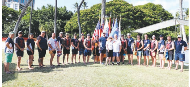
The Na Koa Wounded Warrior Canoe Regatta 2019 in Hawaii.

This event demonstrates what BABA members are doing on behalf of the British Wounded Warriors. For more information on OBXtek, visit www.obxtek.com .